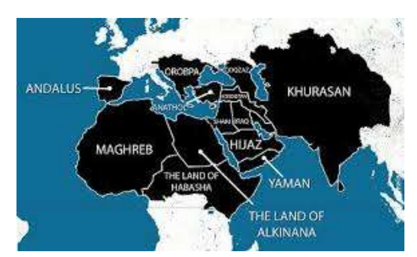
Area of the territory of the self-proclaimed Islamic state

This group is described by the United Nations as a terrorist group and it was defined as a terrorist organization by USA, UK, Australia, Canada, Indonesia and Saudi Arabia. United Nations and Amnesty International accused this group for severe human rights violation.